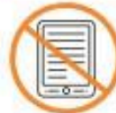
Tablets, E-readers & Other Devices